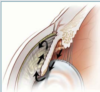
Open Angle Glaucoma: Blockage of the trabecular meshwork restricts the outflow of aqueous fluid, causing an increase of pressure inside the eye.

For many years the most common option for glaucoma patients was the lifelong use of eye drops. Now there is a non-invasive alternative available called SLT. In less than thirty minutes, this painless procedure can help to reduce intraocular pressure to the point where patients may be able to forego medication for several years.