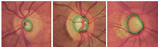
The green ring outlining the gradual enlarging optic nerve "cup" shows the progression of the disease

The eye's aqueous fluid is constantly produced and drained at a balanced rate to ensure the health of the lens and cornea. When this drainage becomes blocked, intraocular pressure increases and open-angle glaucoma (the most common form of glaucoma) occurs. In order to preserve eyesight, it is critical to decrease and control intraocular pressure.